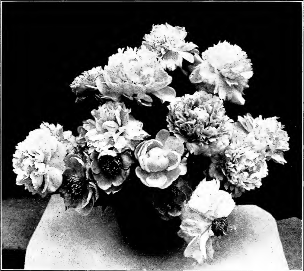
A Basket of Scarce, New Varieties